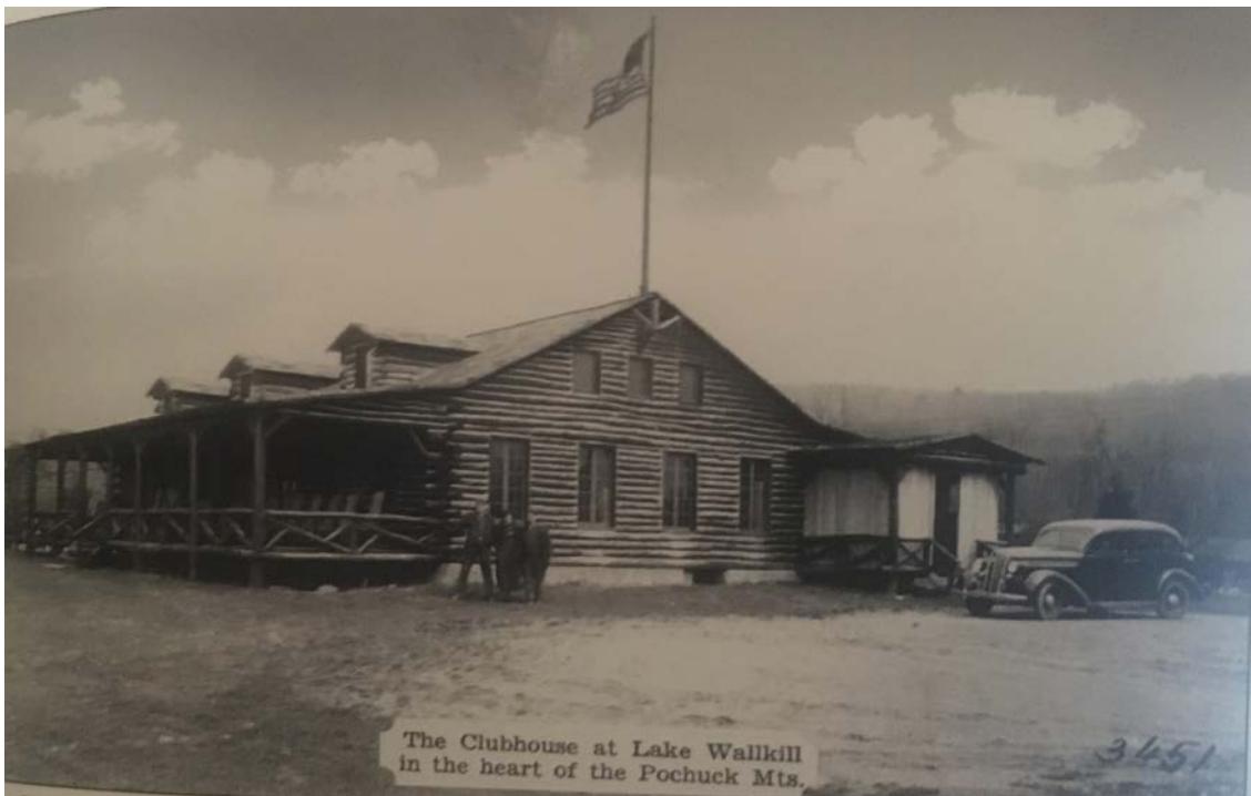
Community Clubhouse circa 1930 1 Clubhouse Road

Clubhouse rentals include the interior "great room" and the back porch with options to use the adjacent lawn area beyond the back porch. Please consult the fee schedule for the rental pricing for the different options.