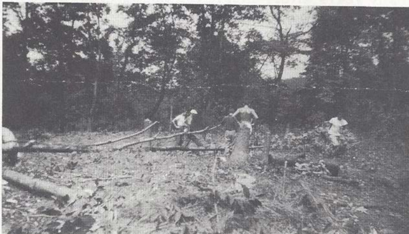
Baseball Field Construction circa 1947

In early spring of 1948, the Lake Walkkill Club purchased the backstop which still stands today. They also had the playing field regraded and planted grass seed.